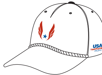
GST8869H 8869H - 5 PANEL WITH BRAID (ADJ. SNAP)