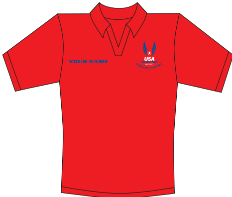
SPORT TECH L469 - LADIES DRI-MESH V-NECK SPORT SHIRT