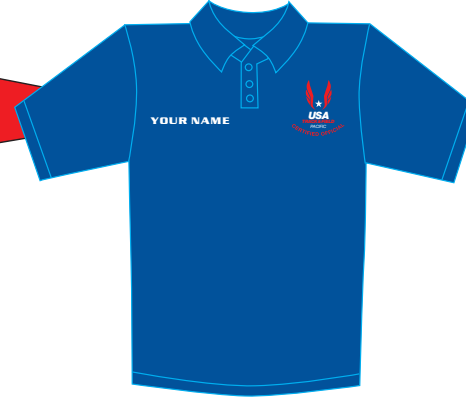
SPORT TECH K469 - MENS DRI-MESH SPORT SHIRT