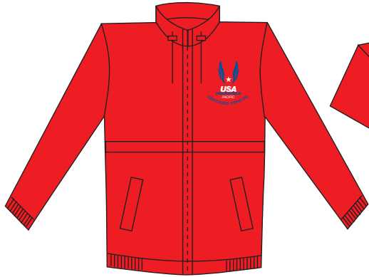
PORT AUTHORITY (OLD STYLE) J753 - CLASSIC POPLIN JACKET