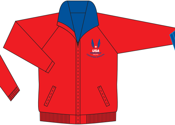
PORT AUTHORITY J754 - CHALLENGER JACKET