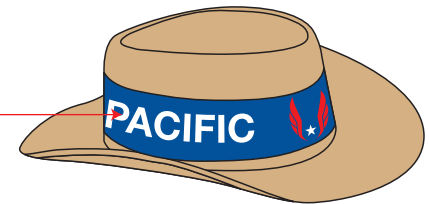
PETER GRIMM PG81 - STRAW HAT - KHAKI