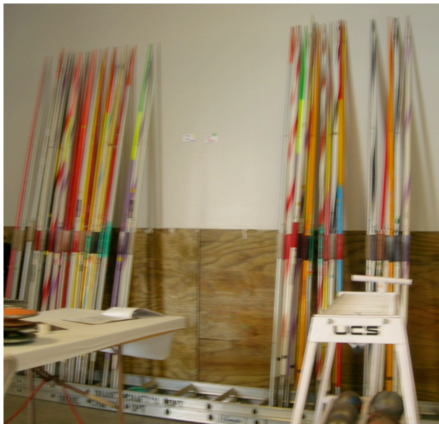
Fig. 3 Layout at Des Moines NCAA Division I