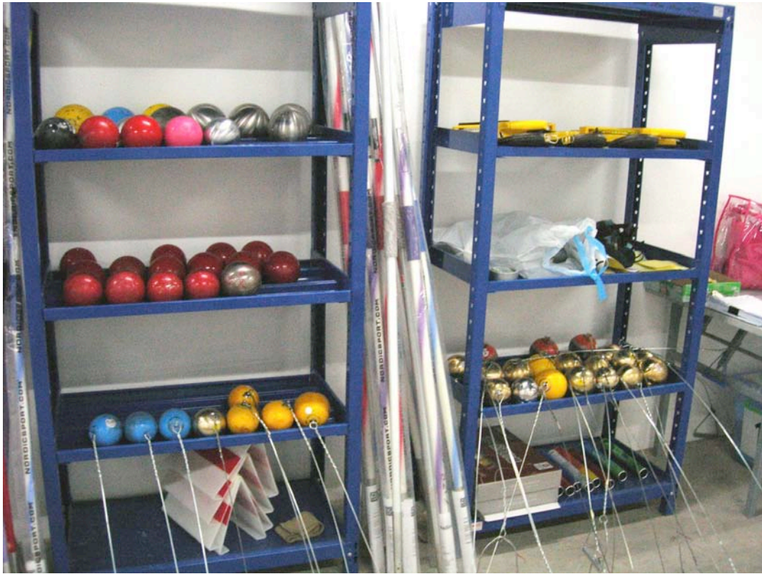
Fig. 2 Beijing Implement Storage