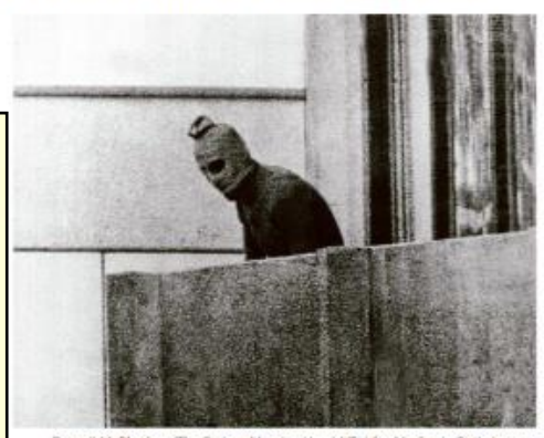
A masked Black September terrorist appears on the balcony of the Olympic Village on Sept. 5, 1972, in this famous photo.

Mason and Arledge faced that same scenario in San Francisco after Loma Prieta,