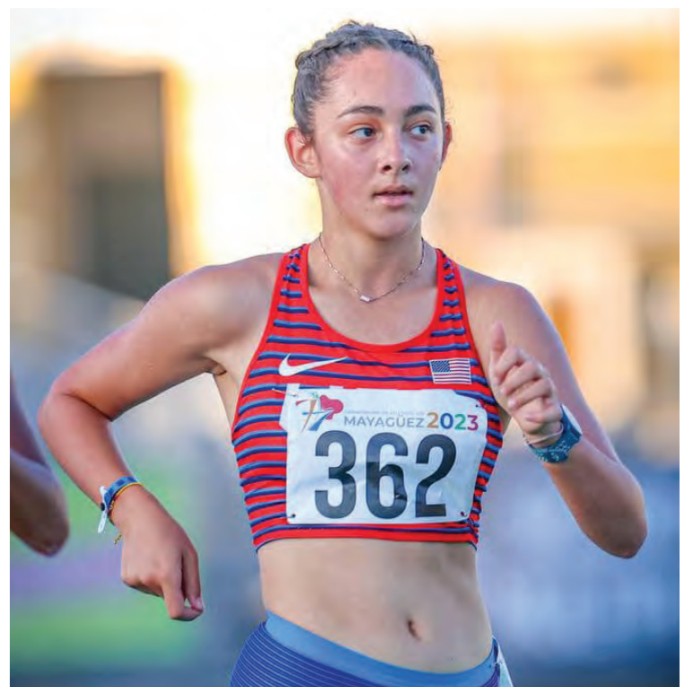
8th Place Women's 20km RW -U.S. Olympic Team Trials 2024